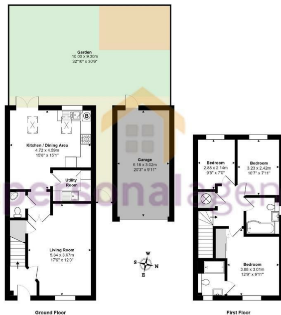
Hayton Crescent, Tadworth Total Area: 93.7 m 2 ... 1009 ft 2 (excluding garden, garage) FOR ILLUSTRATIVE PURPOSES ONLY.

Whilst every attempt has been made to ensure the accuracy of the floor plan shown, all measurements, positioning, fixtures, features, fittings and any other data shown are an approximate interpretation for illustrative purposes only and are not to scale. No responsibility is taken for any error, omission, mis-statement or use of data shown. The above statement applies to both The Personal Agent LTD and the Company or individual displaying this floor plan. Unauthorised reproduction prohibited. © 2018 Moving London LTD (www.stillmovinglondon.com)